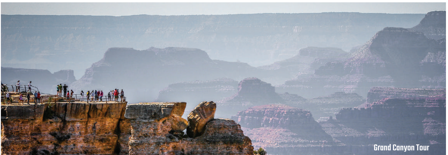
Grand Canyon Tour